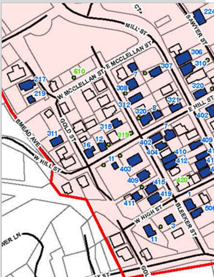
Lead Historic District: top, non-contributing house and contributing garage at 319 Bleeker Street; bottom, portion of sketch map, distinguishing primary and secondary contributing resources and non-contributing resources.