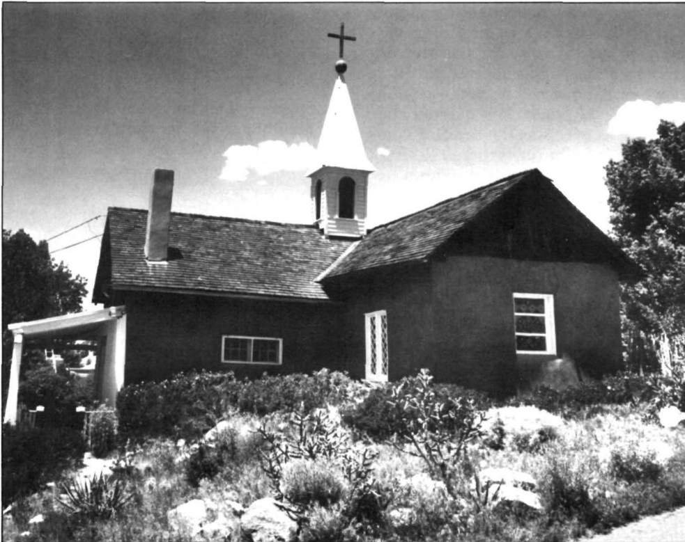
Archbishop Lamy's Chapel, Santa Fe County, New Mexico: chapel used from 1874 to 1909 by Archbishop Jean Baptiste Lamy, whose successes in reviving missions and establishing schools, hospitals, and other social institutions greatly improved community life in his jurisdiction.

houses were built in the 1910s and 1920s in the prevailing Neo-Classical styles. The Reno County Courthouse maintains a very high degree of interior and exterior architectural integrity and is a significant example of the Art Deco style as interpreted in a pre-Depression designed public building.