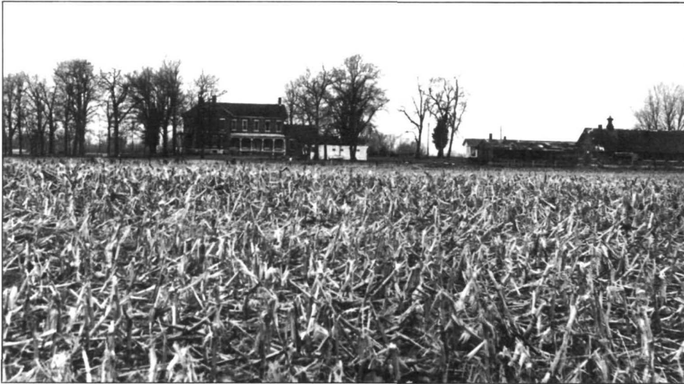
Henry T. Rainey Farm, Greene County, Illinois.