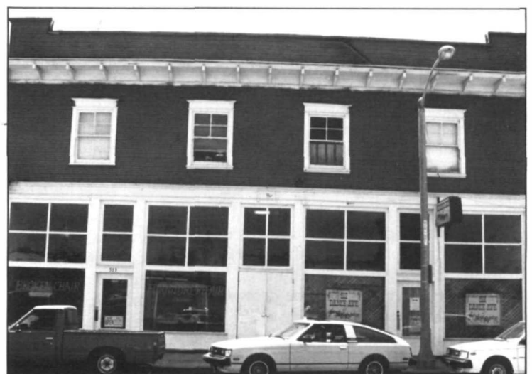
Helme-Worthy Store, Huntington Beach, California, in 1907 and 1986 (1907 photographer unknown;).