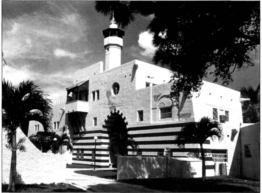
Opa-Locka Company Administration Building, Opa-Locka, Florida: anchor building for planned city conceived by inventor and real estate developer Glenn Hammond Curtiss.

The interior retains much of its original integrity. The wide central stairway runs from the double doors in the front facade to a hallway, shaped like a cross. The hall to the back is an extension of the front hall and leads to the second floor covered porch. The four apartments are arranged along the halls with one in each quadrant. A large skylight is centered in the main hallway. All of the rooms have the original wide woodwork with molding across the top of the lintels. . . . The first floor has had a wall added down the center to form two store spaces. The mezzanine is still visible in the south store, but has been fronted with a wall in the north store. An apartment has been added into the back. The rooms on the north end are original and the high tank toilet is still working. The store on the south is occupied by a furniture restorer and the store on the north contains a dance studio. The apartment across the back was added in the 1920’s and is two-storied, filling in the back part of the first and mezzanine floors. The 1917 addition to the north side is unchanged and presently used for storage. Both the exterior and interior of the building retain their integrity of feeling and association and have a strong visual character.