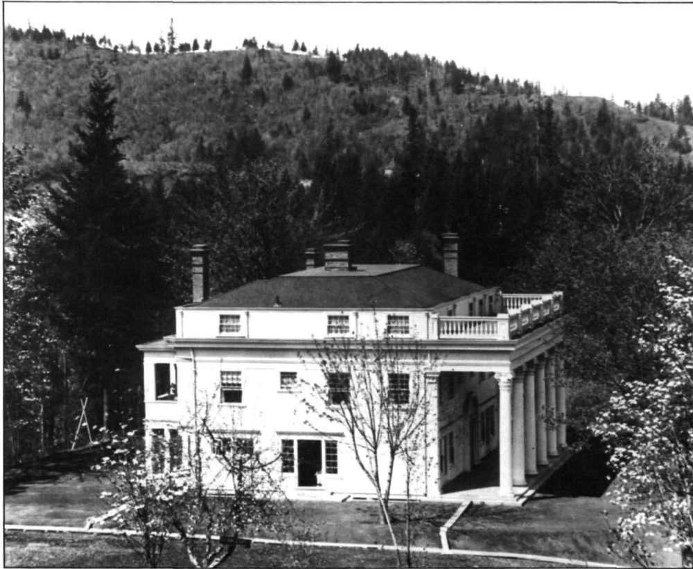
David T. and Nan Wood Honeyman House, Portland, Oregon, ca. 1909: home of progressive leader and reformer Nan Wood Honeyman, the first woman from Oregon to serve in the U.S. Congress (from the collection of the Oregon Historical Society, Neg. No. 35935, #1822).