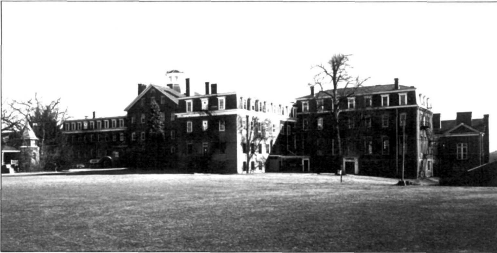
Moses Brown School, Providence, Rhode Island: school (est. 1819) whose contributions to the state's educational, religious, and social development reflect the ideas and objectives of its principal founder, for whom it is named.