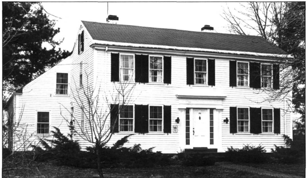
John B. Russwurm House, Portland, Maine.

No. 238 Ocean Avenue in Portland is the only surviving structure closely associated with John Brown Russwurm (1799-1851), who resided there intermittently in the period 1812-1827. Russwurm was this nation’s second black college graduate, a founder and editor of America’s first black newspaper, and