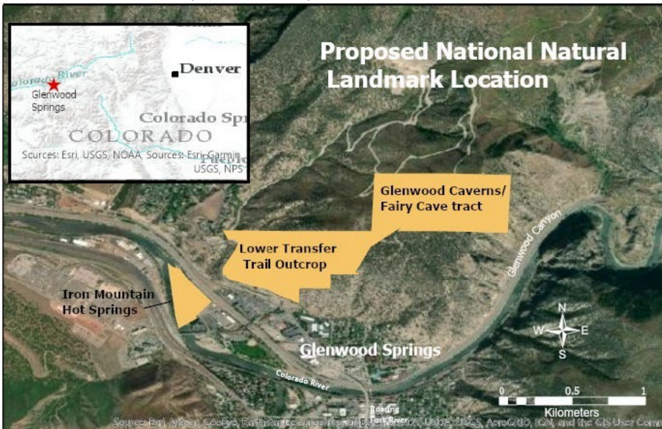
Figure 3. General location of the site west of Denver, Colorado, and the proposed boundary, in yellow, of the Glenwood Caverns and Iron Mountain Hot Springs NNL site.