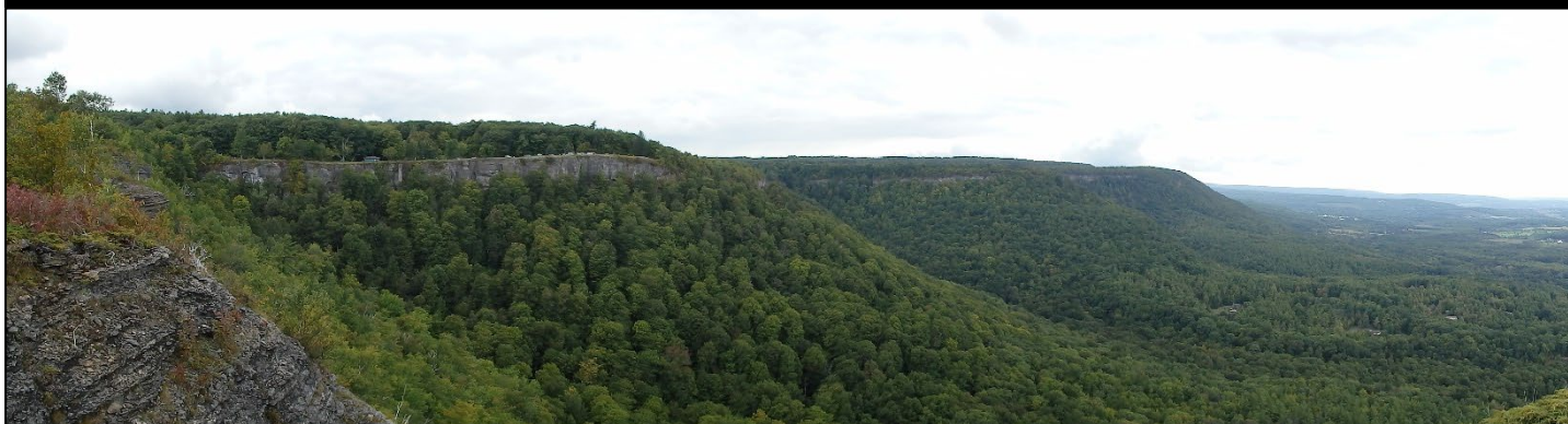
Figure 1. View northwest along the 100-ft cliff of the Helderberg Escarpment toward the Mohawk Valley.