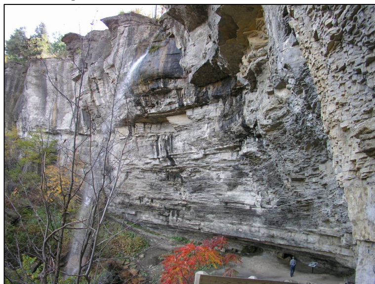
Figure 2. Minelot Creek flows over the 100-ft cliff above the Indian Ladder Trail.

The Helderberg Escarpment at John Boyd Thacher State Park, a striking example of a cuesta, exposes the most complete and minimally disturbed record of middle Paleozoic stratigraphy in the Appalachian Plateaus region, and perhaps across North America. The uniquely accessible, fossil-rich deposits provide a master section spanning 63-million years, foundational in the early study and understanding of North American geology and of widespread ancient mountain building.