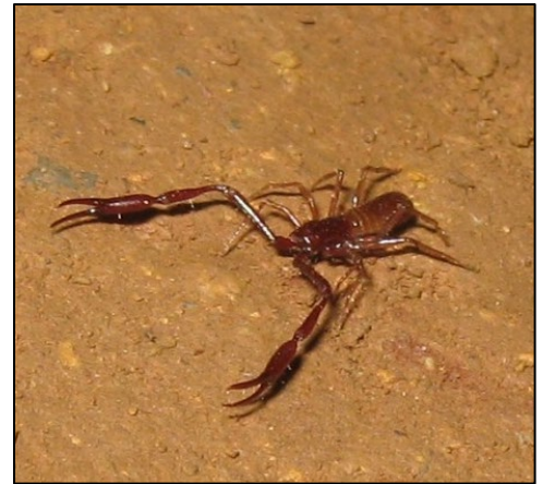
Figure 2. A pseudoscorpion unique to Glenwood Cavern.

The area containing Glenwood Cavern, Lower Transfer Trail Outcrop (Holly Cave), and Iron Mountain Hot Springs is unique for the suite of subsurface, multi-source karst processes expressed at the site that have been operational for around 2.5 million years. The downcutting of the Colorado River into the Leadville Limestone aquifer reveal the timeline and spatial relationships of the site's karstic components, from the relict conduits in Glenwood Cavern and Holly Cave, to the active thermal spring vents of Iron Mountain Hot Springs. Iron Mountain Hot Springs contain active populations of diverse extremophiles, and Glenwood Cavern is host to unique ecosystems containing endemic triglobitic species, as well as unique biothems, such as raised calcitic trails formed by long-term packrat activity, and fossilized extremophiles in the form of pool fingers and u-loops.