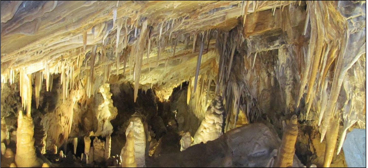
Figure 1. Speleothems decorate the inside of Glenwood Cavern.