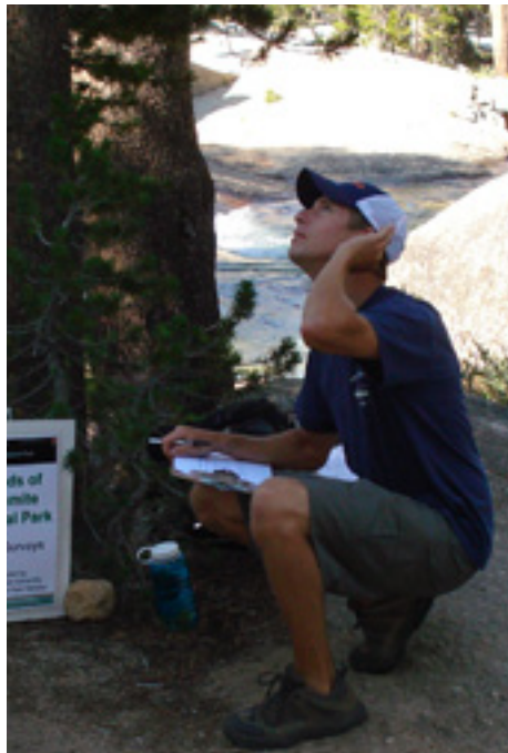
A visitor in Yosemite National Park enjoys the sounds of nature.