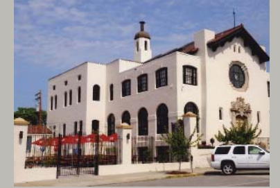
Central States Life Insurance Co. Building, St. Louis, MO

The former Central States Life Insurance Company Building recently became the headquarters of Chameleon Integrated Services (CSI), a St. Louis, MO-based information technology firm, following a $3 million rehabilitation. Individually listed in the National Register, this 1921 Mission Revival-style building was designed for a local corporate headquarters, complete with an impressive two-story atrium. Later used for many purposes, and most recently as a series of nightclubs, CSI purchased the building and returned it to its original use as corporate offices. The building's exterior and surviving historic features on the inside were restored, and state-of-the-art security systems installed. Twenty-seven percent of the work was completed by minority-owned businesses from Greater St. Louis. With their new offices and a building rich in architectural detail, CSI has not only saved an impressive historic resource, but also is contributing to the rebirth of the local community.