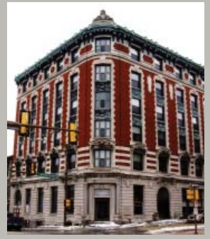
Historic Lafayette Apartments, Butler, PA

The Trinity Place Apartments is a Tudor/Jacobethan-style residential building in Portland, OR, that has remained in use as apartments since its construction in 1910-11. Providing 36 market-rate housing units, Trinity Place Apartments recently underwent a $500,000 certified rehabilitation involving the seismic upgrading of the unreinforced masonry for life/safety.