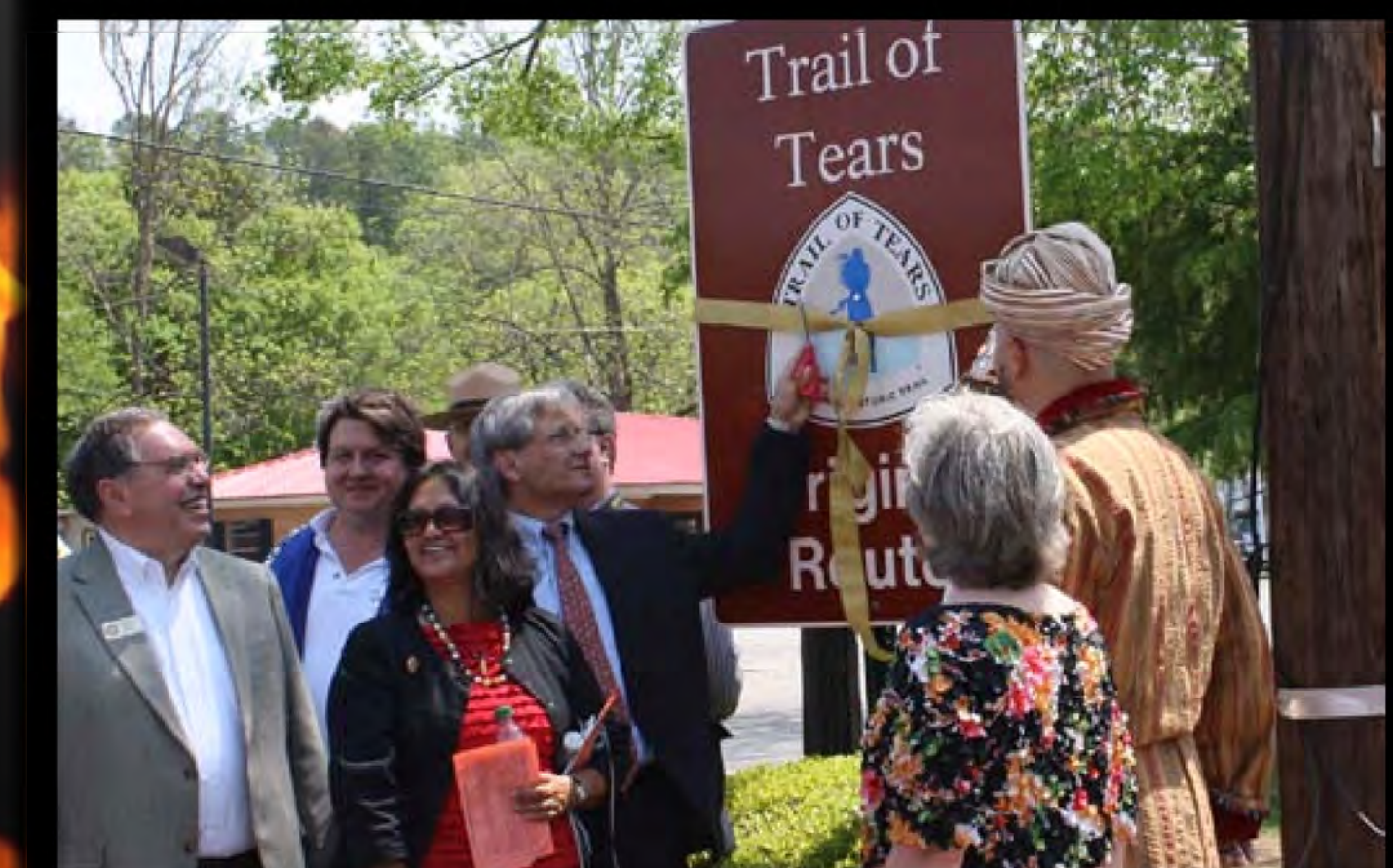
This Cherokee delegation visited Cave Spring in 2011, recognizing its connection to the story of removal. The structure is located on an original route of the Trail of Tears National Historic Trail.