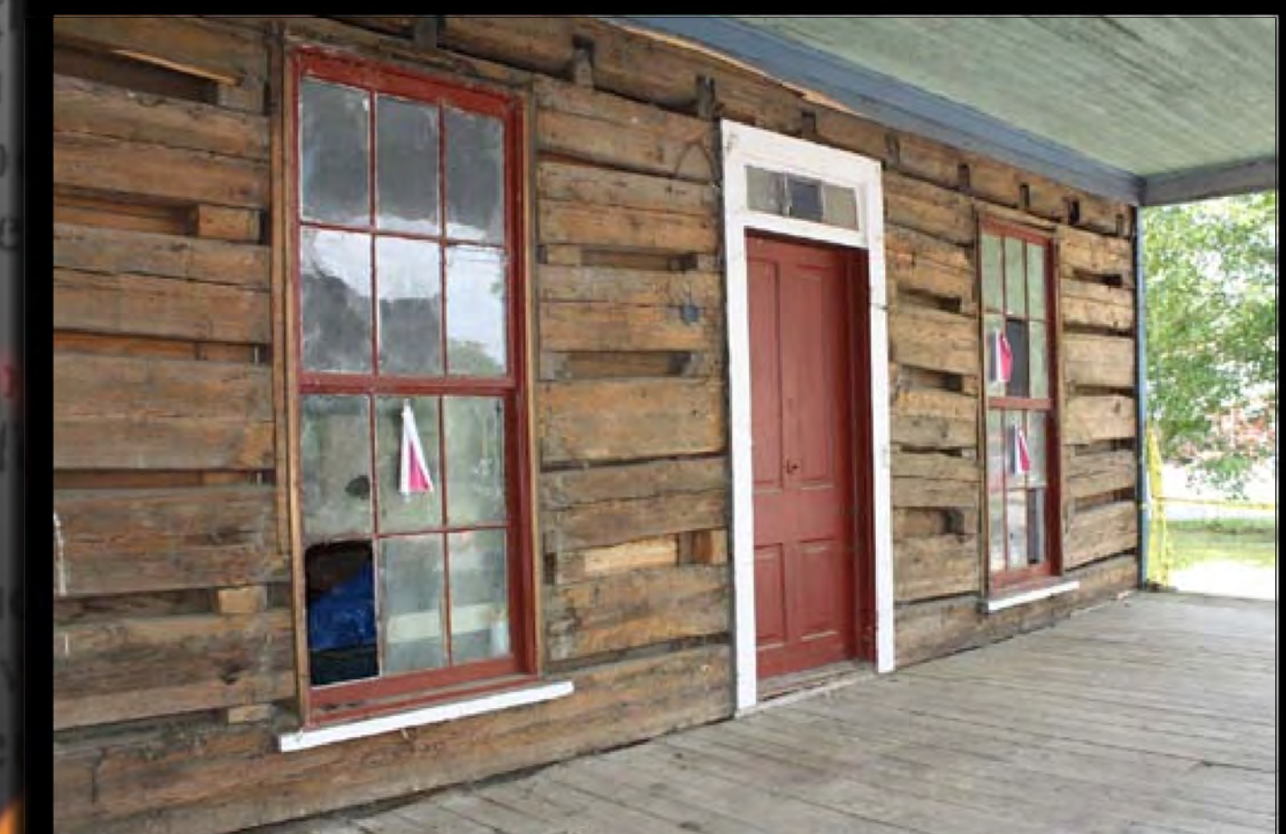
The Green Hotel, in front of you, contains within it an original log structure that predates Cherokee removal, possibly as early as 1810.