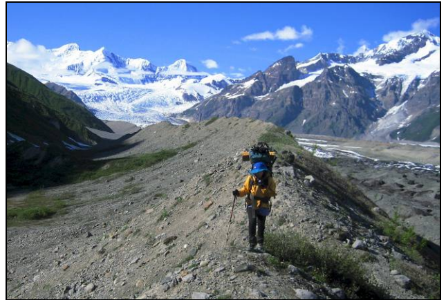
Backpackers following a lateral moraine west of Kennicott Glacier.

Trails, airstrips, and landings provide access to remote wilderness.