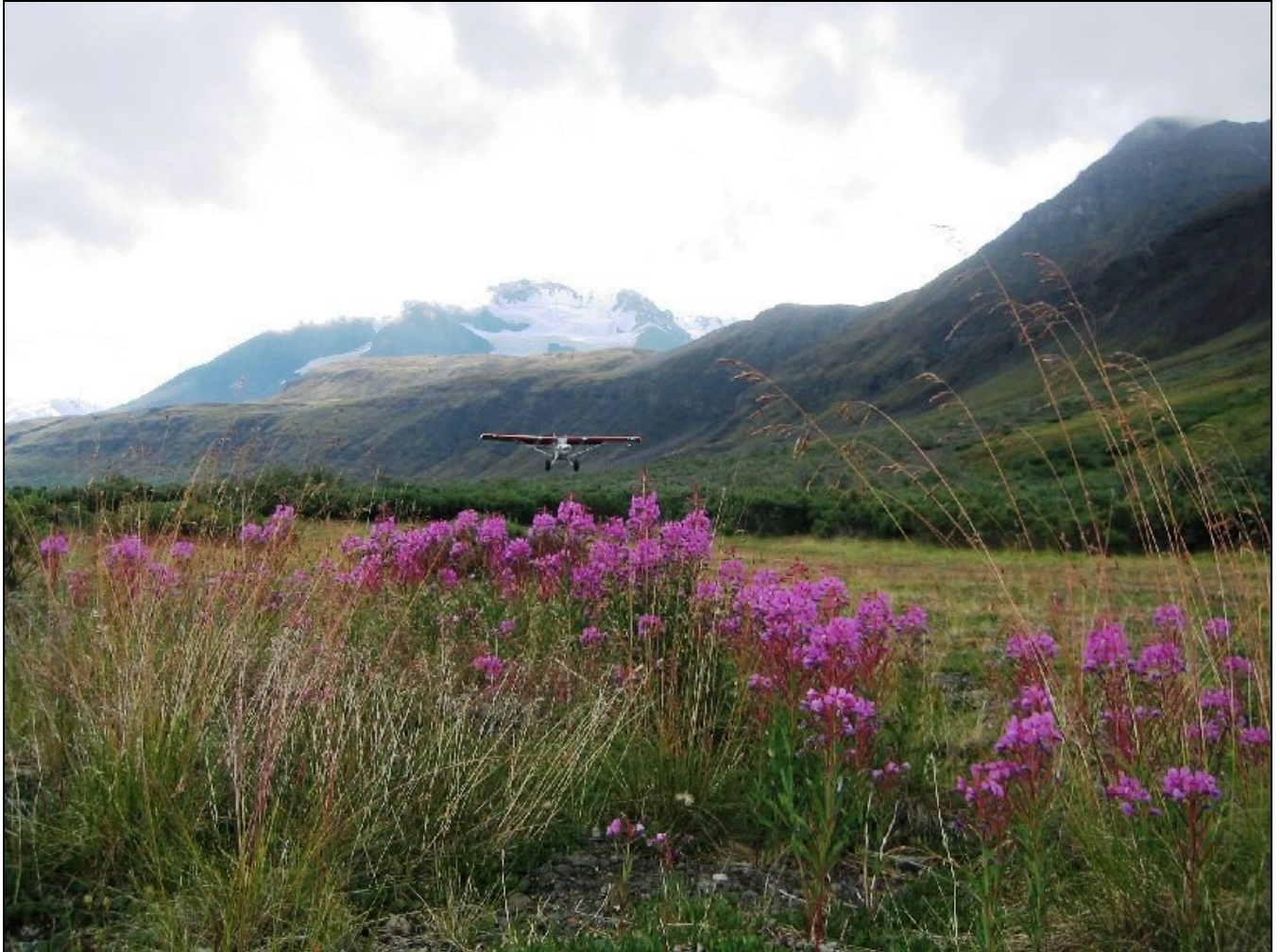
A remote airstrip provides access at Skolai Pass.

Appendix B includes legislation that, while superseded by ANILCA, offers contextual background information regarding the establishment of Wrangell-St. Elias National Park and Preserve.