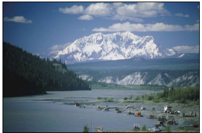
Fishwheels turn on the Copper River near Chitina, with Mt. Drum in the background.

Educational Opportunities Wrangell-St. Elias National Park and Preserve provides the opportunities to learn about the glacial river systems, and to perform scientific research regarding them.