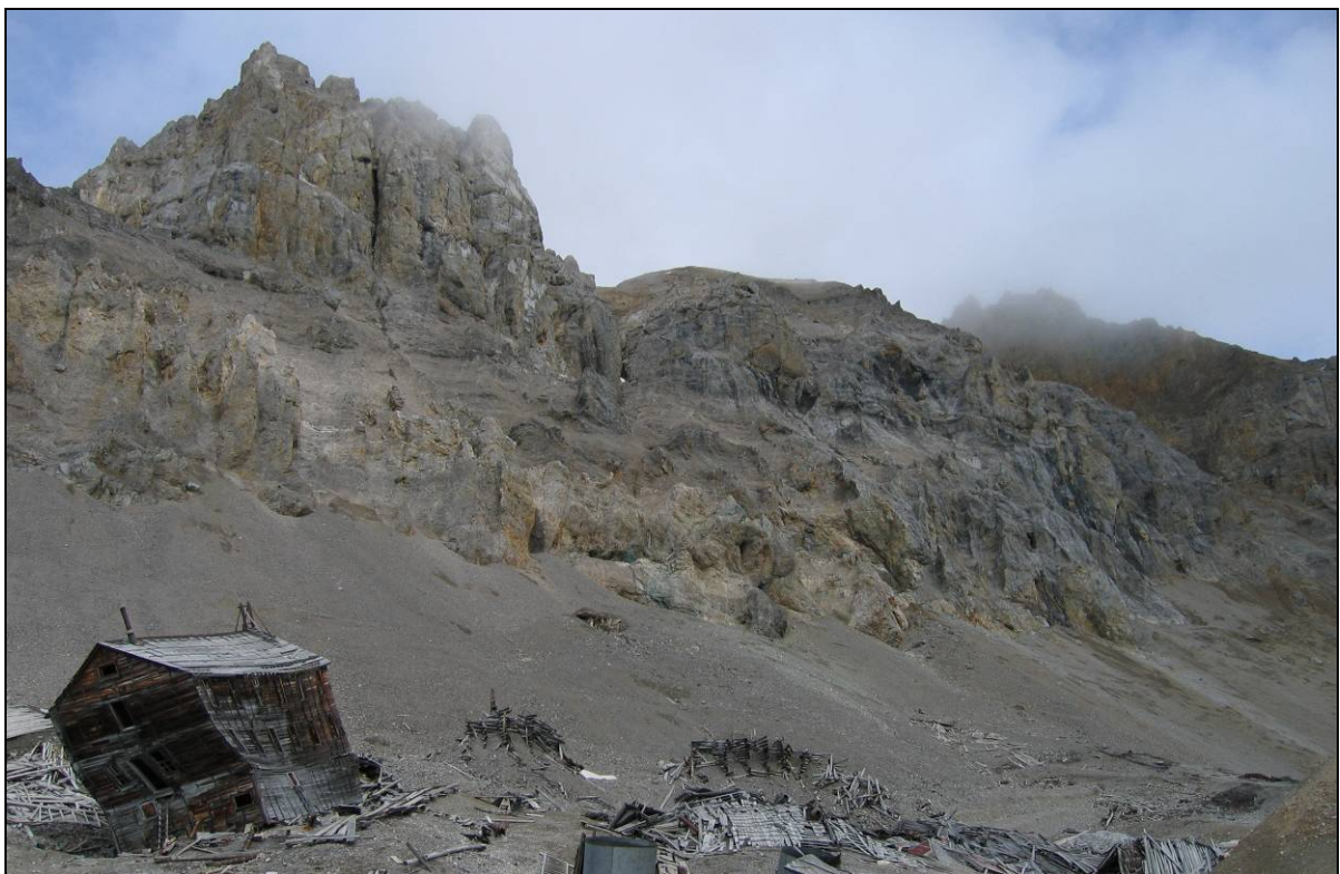
The ruins of Kennecott's Jumbo Mine camp rest near Bonanza Ridge.