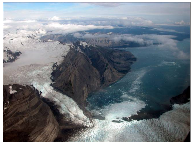
Wrangell-St. Elias National Park and Preserve contains a variety of ecosystems.

Moose, Dall's sheep, caribou, mountain goat, wolf, grizzly bear, black bear, lynx, wolverine are some of the species that live within the park and preserve.