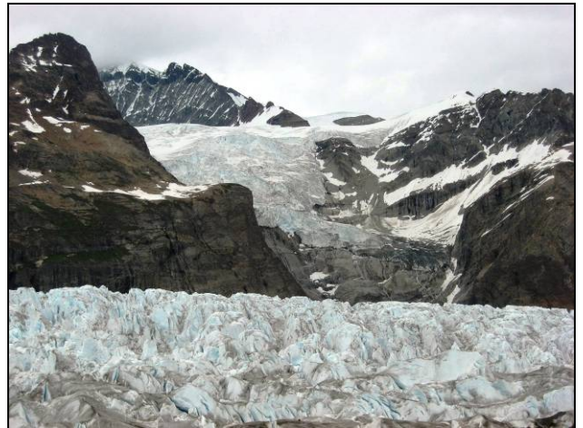
Glaciers in upper Kennecott Glacier Valley.

The park and preserve ensures the opportunity to explore, learn from, and add to the body of scientific research in regards to glacial systems.