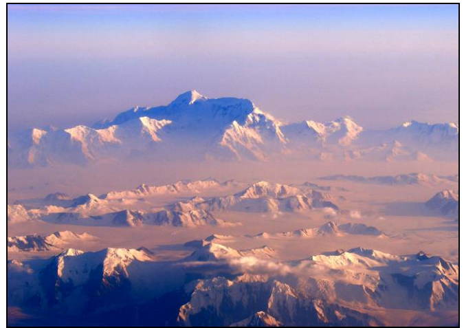
Mount St. Elias rises above the surrounding mountain range.

Wrangell-St. Elias National Park and Preserve provides opportunities to learn about the earth's history and geologic processes, and to perform scientific research.