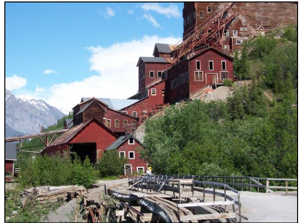
The Kennecott mill town is one of the park’s most iconic features.

The park maintains collections, which include cultural objects, photographs, oral histories, historic resource maps, archives and natural collections of flora and fauna specimens.