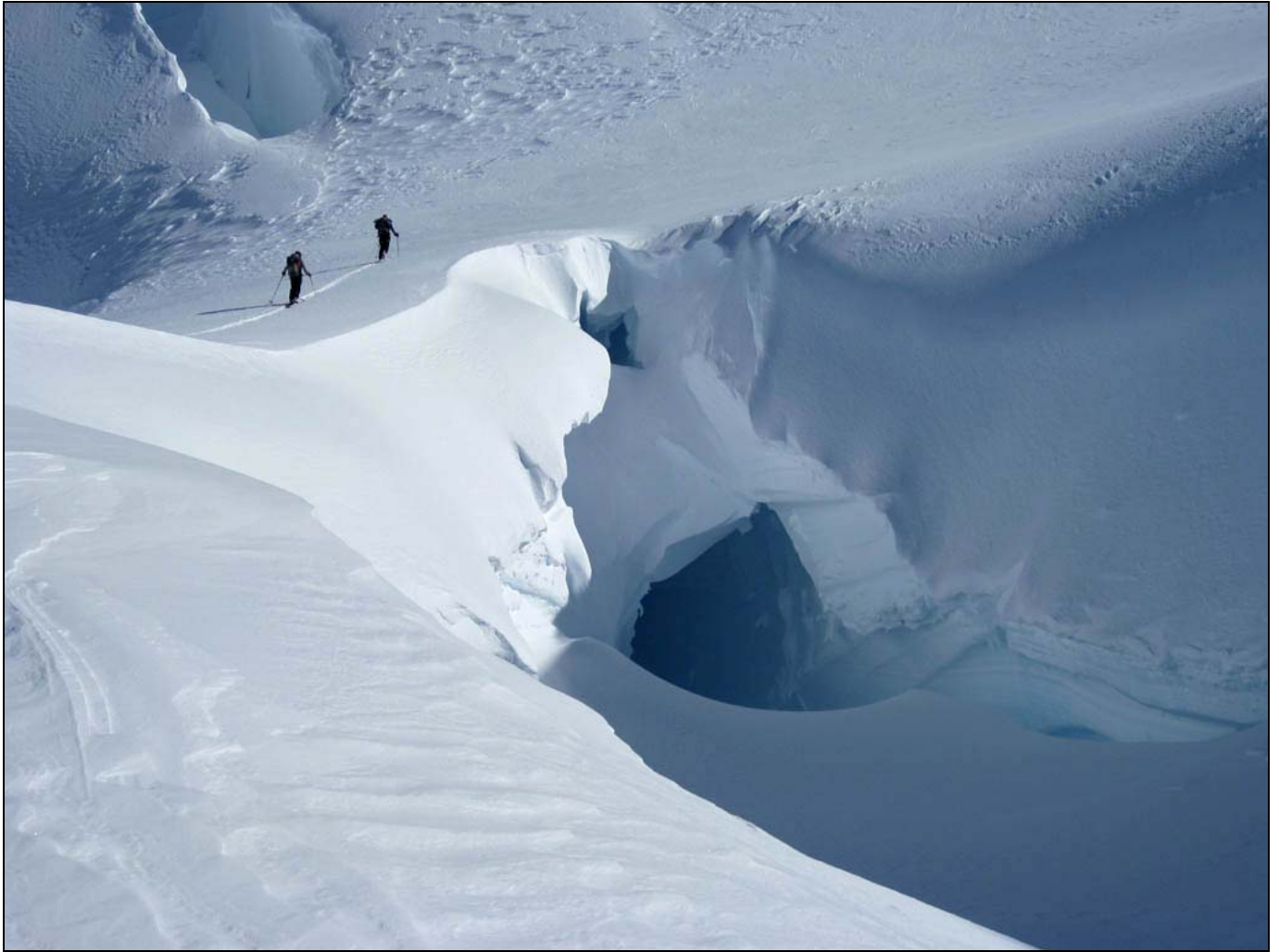
Climbers cross one of many glacier ice bridges found in Wrangell-St. Elias National Park and Preserve.

Appendix A includes selected excerpts from ANILCA that are most relevant for the day to day management of Wrangell-St. Elias National Park and Preserve.