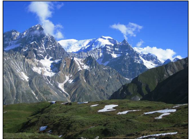
Lakina Valley, the site of many scenic vistas.

Natural, undeveloped viewsheds, including water bodies and landforms dominate the viewscape of Wrangell-St. Elias National Park and Preserve.