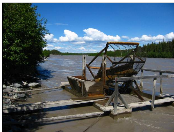
Salmon are a crucial part of local lifeways.

Access for subsistence users, commercial fishermen, private property owners, and those engaged in traditional activities.