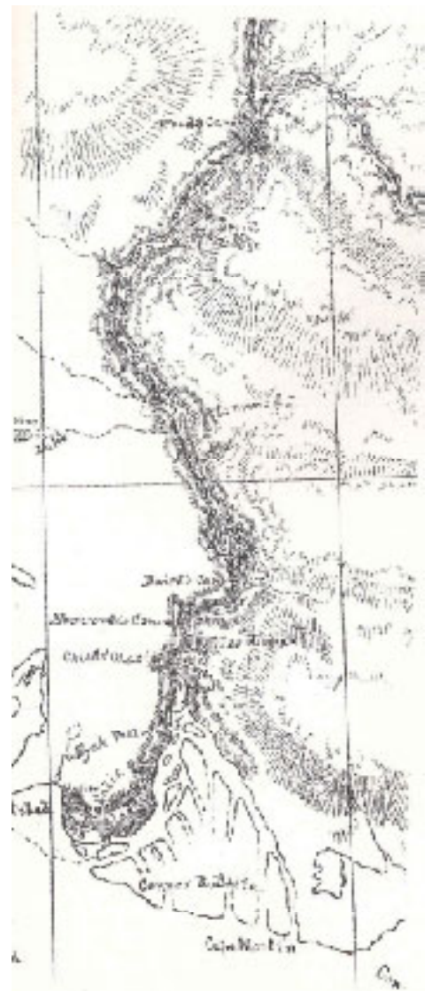
This map from the official 1887 Allen Expedition report shows the lower portions of the Copper River.