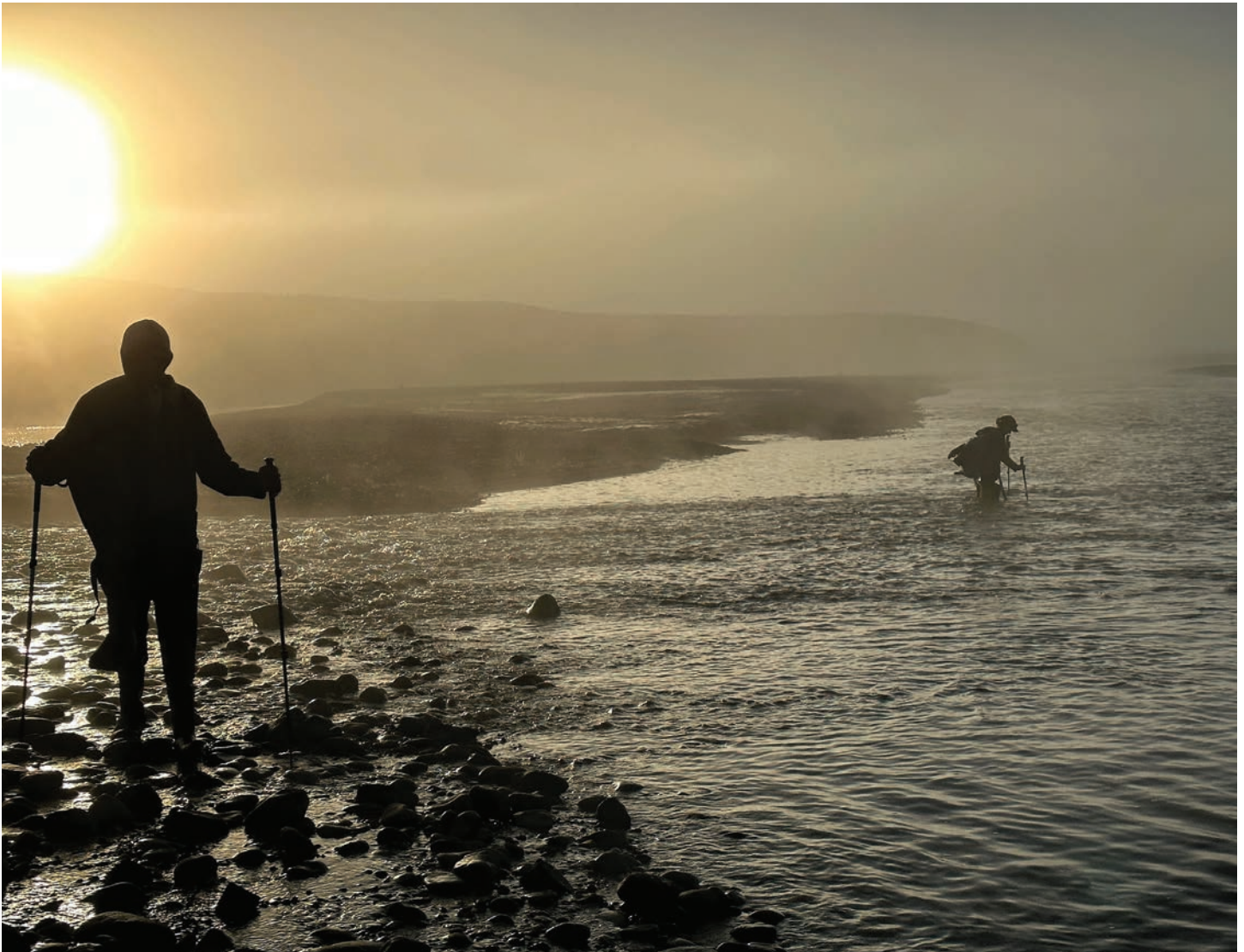
Nikki Tatton and Jeremy SunderRaj ford the Lamar River to search for the remains of 1276F, the lead female of the Junction Butte pack. She was presumed dead following a severe injury to her lower jaw in September. Despite staff diligently searching for her (her radiocollar no longer functioned), she remains undiscovered in the wilds of Yellowstone.

study. The pack produced four pups, possibly by former lead female 1090F although genetic analysis is needed. More male wolves from the Junction Butte pack joined Mollie's in 2023: 1339M in June and an uncollared gray and uncollared black in November. The latest two likely created tension between the first Junction Butte/Rescue Creek males to join Mollie's in mid-2022. Their age difference meant that they probably did not know each other well, despite having the same pack origins. As a result, former lead 1272M, former lead 1090F, and an uncollared black male all dispersed. Initially the trio were found together but eventually the uncollared black male rejoined Mollie's pack. Wolf 1272M was killed in Montana during the wolf hunting season, and 1090F was found alone or occasionally with or near Rescue Creek pack wolves.