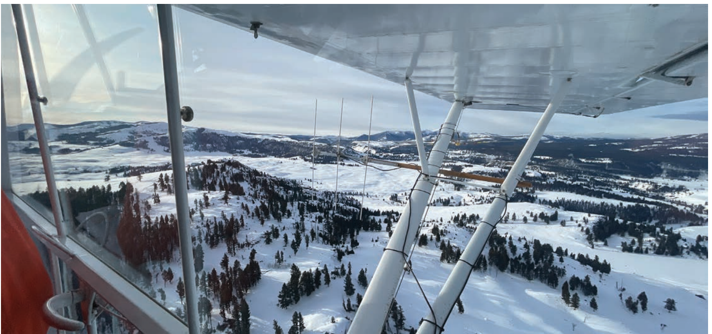
A winter view of Blacktail Plateau from the window of a Super Cub during a wolf tracking flight is spectacular.

At the beginning of 2023, 57 cow elk in YNP were radio-collared. Of these, 55 were GPS collars and two were VHF collars. There were 15 radio-collared elk mortalities documented this year. Six were killed by wolves, four died of malnutrition/exposure due to severe winter conditions