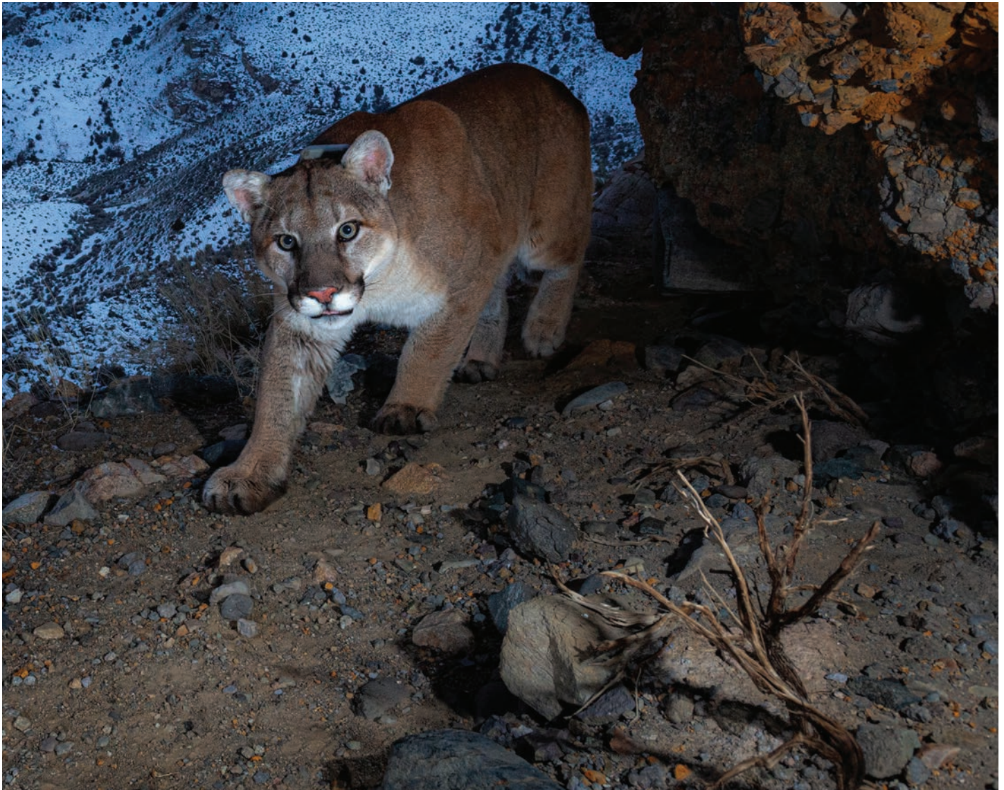
Adult male cougar M229 triggers a remote camera a week after he was successfully captured and GPS-collared. M229 was a territorial male in northern Yellowstone in 2023.

A noninvasive genetic survey conducted from 2014-2017 estimated between 34-42 cougars (of all age and sex classes) resided in the northern range of YNP. This indicates a stable population similar to population estimates near the end of 2006. Today, the Cougar Project uses a remote camera survey grid established in the winter of 2020-2021 to estimate population trends, leveraging data from both GPS-collared and unmarked individuals that trigger cameras. While data analyses are still underway, preliminary estimates suggest similar abundances to the 2014-2017 monitoring period, and that YNP's cougar population remains stable.