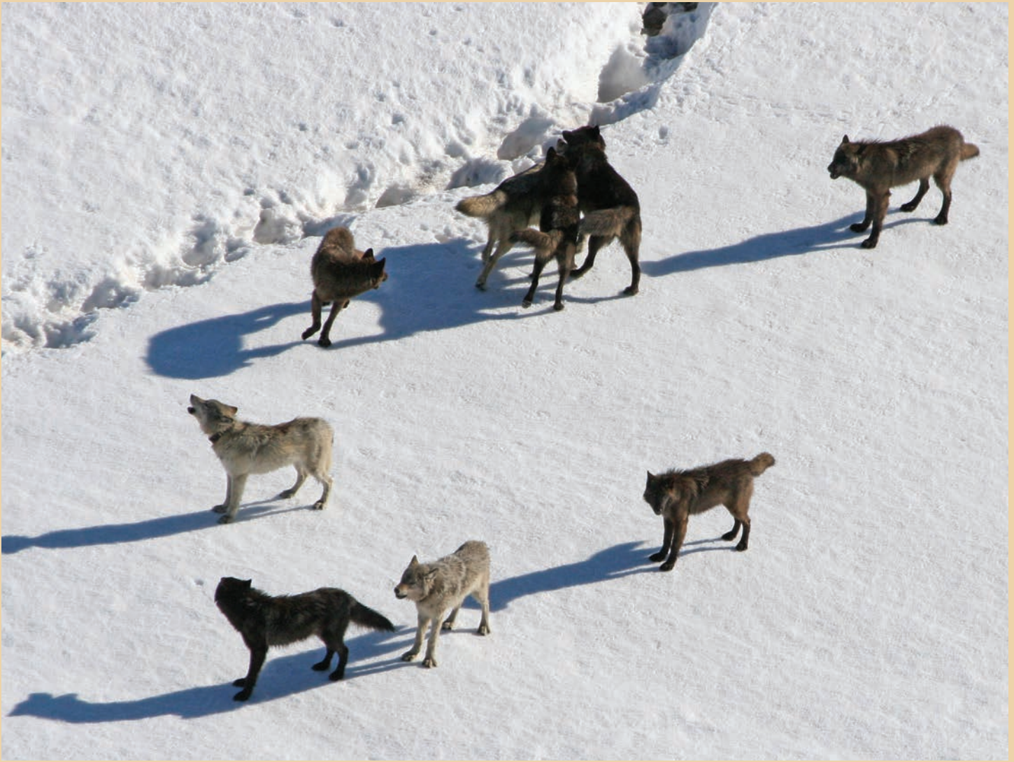
Wolf packs use howling as a means of communication both between and within packs. Often, a few howls by one wolf will trigger other wolves to join in, eventually leading to a chorus and a social greeting with pack mates. This often includes wagging tails, licking faces, and submission or dominance postures to reinforce social hierarchies and bonds.

recording units (ARUs) in efforts to monitor presence and distribution of wolves across the park. Accurate population and occupancy estimates play a vital role in the Yellowstone Wolf Project's objectives. Because wolf vocalizations carry for relatively long distances, the use of ARU's can enhance existing census efforts that largely involve monitoring radio-collared wolves and the packs to which they belong. As we move forward in our long-term efforts to monitor wolves, we seek to incorporate ever-advancing technologies and methods that are viable alternatives to radio collars.