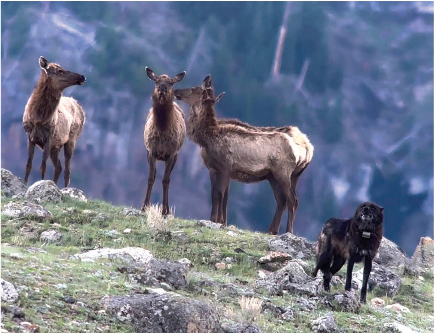
Dominant male of Lupine Creek Pack, 1232M, howls to reconnect with his packmates while some elk observe safely nearby.

that accumulated throughout early 2023, one was killed by a cougar, one of unknown natural causes, two from unknown causes, and one in the Gardiner youth hunt in Montana. The average age of collared elk that died in 2023 was just over 14 years old, ranging from 8 to 19.8 years old. Three elk went missing in 2023 when their radio collar beacons failed, but at least one, elk 2305, was found alive near the end of the year. This was confirmed when staff observed her and matched up the unique number on her collar's belting.