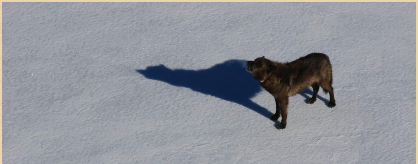
In combination with radio collars and direct observations, we hope to learn even more about wolf communication using autonomous recording units. Work developed in YNP may someday be used to achieve conservation and monitoring goals of different species of wildlife around the world.