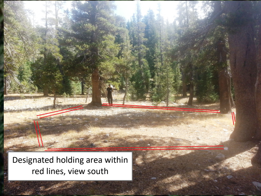
Designated holding area within red lines, view south