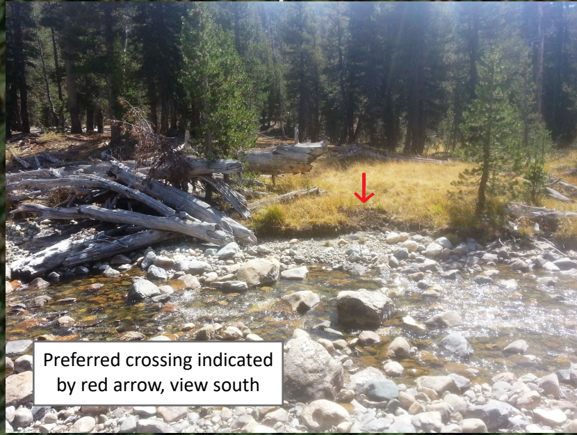
Preferred crossing indicated by red arrow, view south