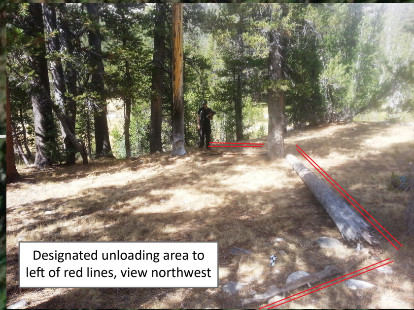
Designated unloading area to left of red lines, view northwest