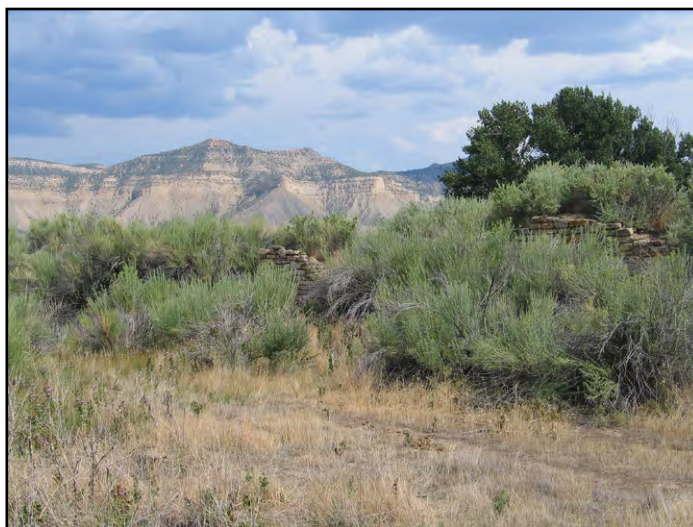
Stabilized wall at Yucca House, Mesa Verde in background.

...you see two areas with large mounds of rubble covered with vegetation. Toward the base of Ute Mountain is the “West Complex,” a large pueblo with an estimated 600 rooms, over 100 kivas, and a great kiva (that perhaps served the entire community). A productive spring flows through the middle of the complex. “Upper House,” the highest portion of the West Complex, rises 15 to 20 feet above the nearby architecture, dominating the surrounding landscape. It must have been an impressive building. To your east is the “Lower House” with some of the only visible standing masonry at the site. The “Lower House” is an L-shaped pueblo with at least eight first-story rooms. A low wall encloses the plaza with a great kiva at its center. Yucca House, one of the largest archeological sites in southwest Colorado, acted as an important community center for the Ancestral Puebloan people from A.D. 1150-1300.