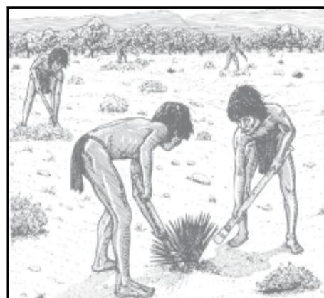
Ancestral Puebloans harvesting yucca plants and preparing fields for planting.

As you walk around, take a moment to think about what it may have been like to live in Yucca House. In A.D. 1200 it was a vibrant pueblo, full of people and surrounded by farmland. Imagine the sun’s rays reflected on the carefully planted clumps of corn, beans, and squash. Families tended their fields and weeded with pointed digging sticks, hoping for summer rain showers. Smoke of Utah juniper filled the air and mixed with the smell of roasting turkey as the sun went down in the evening. Elders shared stories of “when the world was soft, beginning” in the circular, subterranean rooms called kivas.