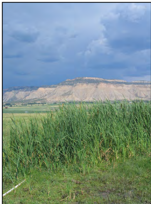
Cattails define marshy locations watered by springs.